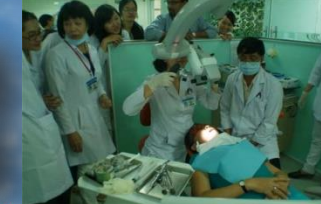
Microscopic endodontic treatment