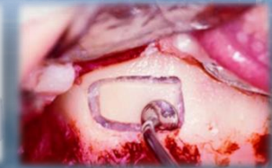
Using piezoSurgery in sinus floor elevation